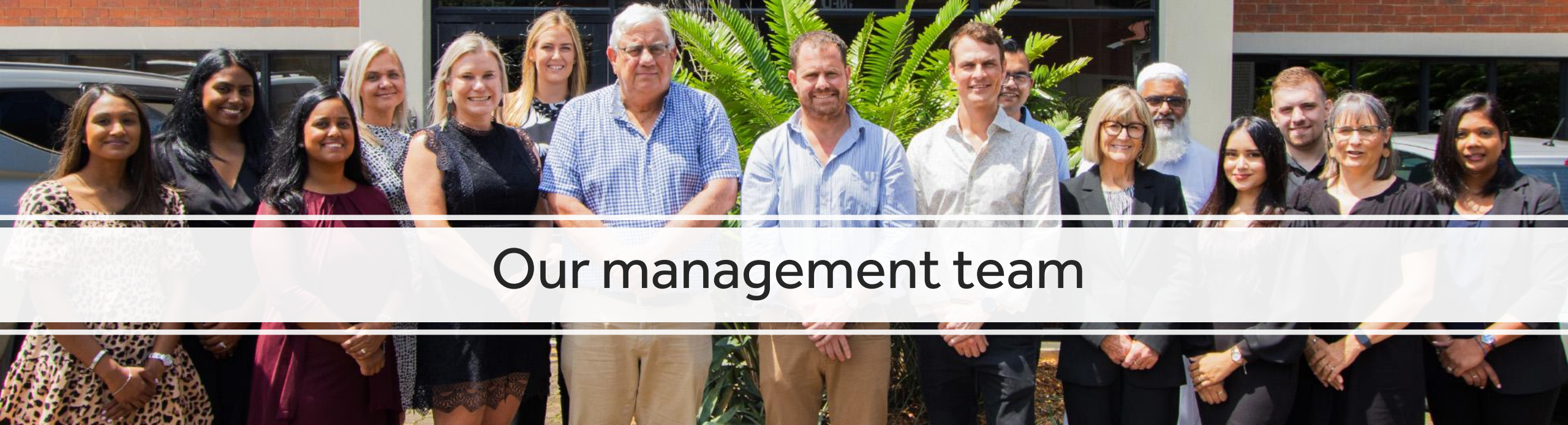
Our management team